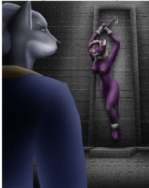
Illustration 7: © Cyberwuffy. Image by Tiel Stonecutter. Color by SnowRoseRivenstar.

As soon as Katt got her bearings straight, a door opened. An ambient white light shined into the room, hiding a mysterious figure at the arch of the doorway. Katt could see herself now. All of her clothing was gone. She looked up towards the darkened figure in the doorway. "Computer—lights," the familiar voice called. The computer made a chirping noise of acknowledgment and normal light levels showered the holding cell.