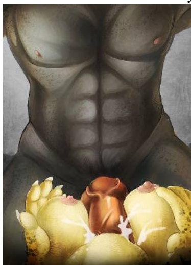
Illustration 13

By this time, Denga had dismounted Tera and already rolled the big cat on her back where he was enthusiastically tit-fucking the leopard's ample cleavage. The large danish erection easily made its way up to his partner's hungry mouth. Tera took to fingering herself with a free paw while rasping her rough feline tongue along Denga's slick rod. Denga brushed a paw across the leopard's face, kneading at her right ear softly. His other paw gently teasing at one of her swollen nipples. Tera captured the dane's thick pole in her muzzle, circling her tongue around the dog's sensitive cock head.