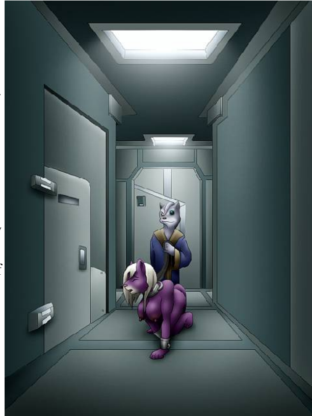
Illustration 8

"Shut up and do it," Wolf growled. Not wanting to make things worse, she took the set of cuffs she was given and latched her right paw to one of the posts on the bed's headboard. Wolf came up to the bed slipped out of his robe. He finished the job, latching her other paw and feet to each corner of the bed. The mercenary's thick cock was fully extended and pulsing with arousal. He climbed on top of the bed and cuffed the rest of Katt's body to each end of the bed. Not wanting to waste time in getting what he was after, Wolf settled on top of Katt and pushed his cock deep inside of her. Katt screamed. She was being raped.